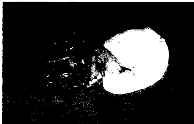
Figure 1: Photograph showing laminated membrane; the ectocyst along with the excised submandibular gland.

attached to a syringe. This fluid was sent for cytological examination, and did not show any malignant cells. The swelling became inflammatory and painful after needle aspiration. The patient was prescribed analgesics and antibiotics. The inflammation subsided but the swelling persisted and was explored under general anaesthesia with the planning of excision of left submandibular gland. During dissection the cyst ruptured with leakage of clear fluid which was quickly aspirated and the white laminated membrane, the ectocyst became obvious and only then it was diagnosed as hydatid cyst (see photograph), further confirmed after complete dissection and histopathology.