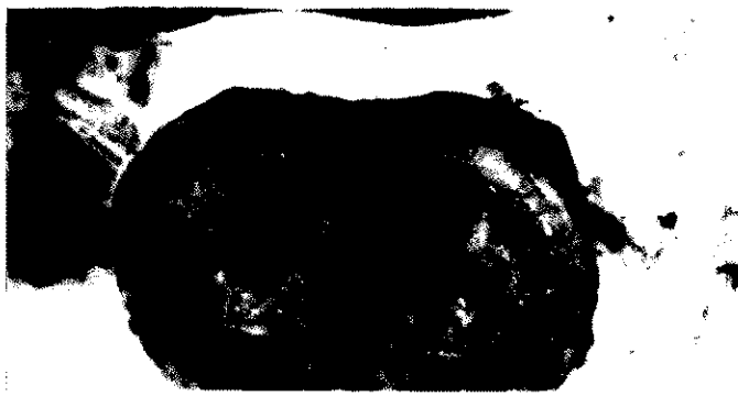
Figure II: Neck tumor section

The mass weighing 800 gm with dimension delineated in C. T. scanning (14*10*10 cm) was removed (Figure 2).