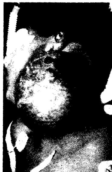
Figure 1: Neck tumor

A 15 years old boy presented with a large swelling in the left parotid region. This swelling was present since early childhood, but had shown recent rapid increase in size. Swelling was occupying whole of the parotid region extending Posteriorly to the occiput, anteriorly to the angle of the mouth inferiorly it was extending upto the clavical (Figure - 1).