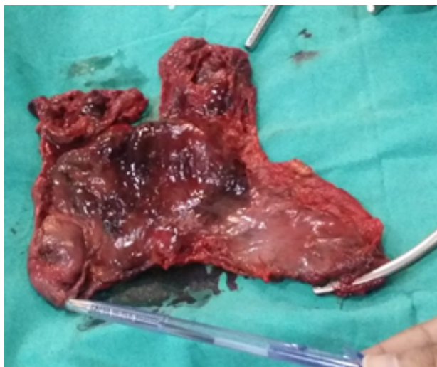
Fig II: Per operative findings of gangrenous stomach